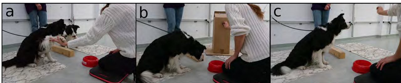
Figure 1. Paw task setup. Paw task setup with a conspecific (a) and the box (b) as partners, and with no partner (i.e. empty space) (c).

For the social conditions, the experimenter began the session with the partner (i.e. asking the partner for the paw and feeding the partner); however, for the asocial conditions, the experimenter generally began each session with the subject (i.e. a reward was typically not deposited in the box before asking the subject for the paw).