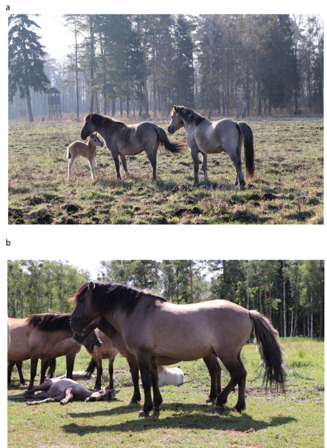
Fig. 4. (a.) Two-year-old stallion with a mare and her foal – they all belong to a dominant stallion harem (picture taken April 2023, Popielno reserve, Poland). This stallion was still present in the same harem as a satellite stallion in 2025. Between 2022 and 2025, he changed his status several times by taking over some mares and losing them again and (b) The Konik polski dominant harem stallion resting in the proximity of his harem (including a satellite stallion from Fig. 4a) in the Popielno reserve, Poland (photo taken in July 2022).