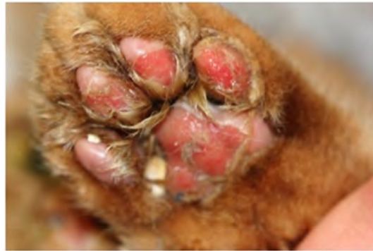
Figure 10. Excoriations of paws in a cat with VS-FCV infection.