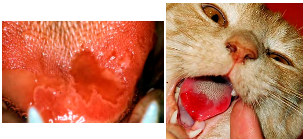
Figure 4. Ulcerative lesions on the tongue of cats with FCV infection. Left, ©Marian C. Horzinek; right, ©Tadeusz Frymus.

Clinical findings can differ, depending on the FCV strain, the age of the affected cats and husbandry factors. While in some cases infection is subclinical, in many others, there is a typical syndrome of lingual ulcers (Figure 4) and a relatively mild acute respiratory disease. More severe signs can resemble the respiratory disease caused by FHV; however, frequently occurring co-infections with FHV, Chlamydia felis , or Mycoplasma felis might be responsible for some of the respiratory signs rather than FCV itself [2].