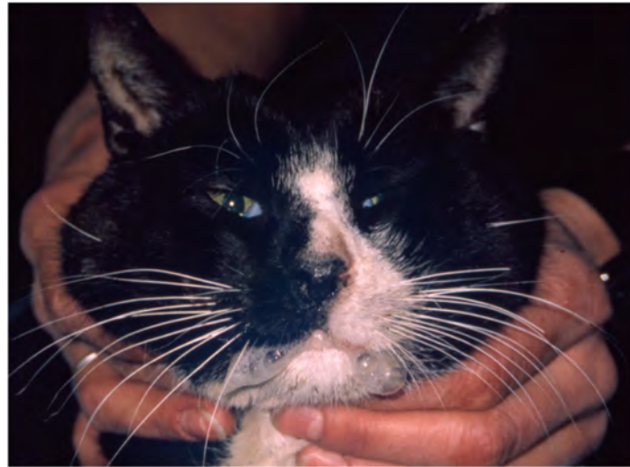
Figure 5. Hypersalivation in a cat with FCV infection. Tongue ulceration can be very painful, leading to impaired food and water uptake and hypersalivation.

Acute oral and upper respiratory disease signs are mainly seen in kittens. The incubation period is two to ten days [3]. Oral ulcerations, sneezing, and serous nasal discharge are the main signs [61]. Fever is also commonly observed. Anorexia, sometimes accompanied by hypersalivation (Figure 5) due to oral ulcers (located mainly on the tongue), is often more prominent than signs of rhinitis [2,86]. Signs usually resolve after a few days with only symptomatic treatment [87,88].