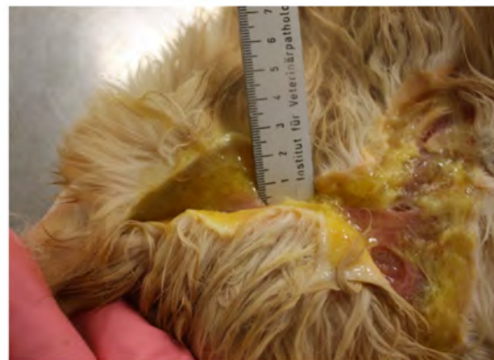
Figure 11. Jaundice and oedema of the subcutaneous tissue at necropsy of a cat with VS-FCV infection (case 11, [102]).