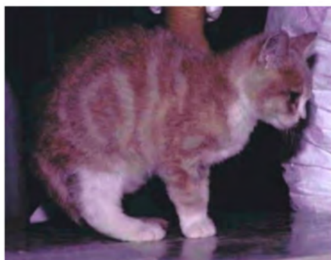
Figure 3. Calicivirus infection limping syndrome.

and FCV can be isolated from affected joints [5]. Limping syndrome can also occur after FCV vaccination with some modified live virus vaccines [6].