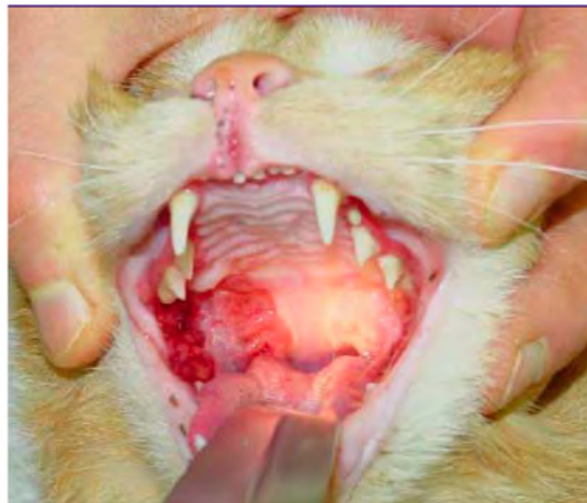
Figure 6. Feline chronic gingivostomatitis.

It has been suggested that FCGS is an immune-mediated reaction to FCV (and potentially other oral antigens). The disease has not been reproduced experimentally using two different FCV isolates from cats with FCGS for oronasal infection (Knowles et al., 1991). Moreover, FCV isolates from cats with different acute or chronic respiratory disease signs or from cats with chronic oral lesions induced an acute disease with fever, apathy, oral ulcers, gingivitis, rhinitis, and/or conjunctivitis when experimentally inoculated in kittens, indicating that chronicity is probably more related to the host immune response than to any particular biotype of FCV [26]. FCV does not appear to play a role in feline odontoclastic resorptive lesions (FORLs) [97].