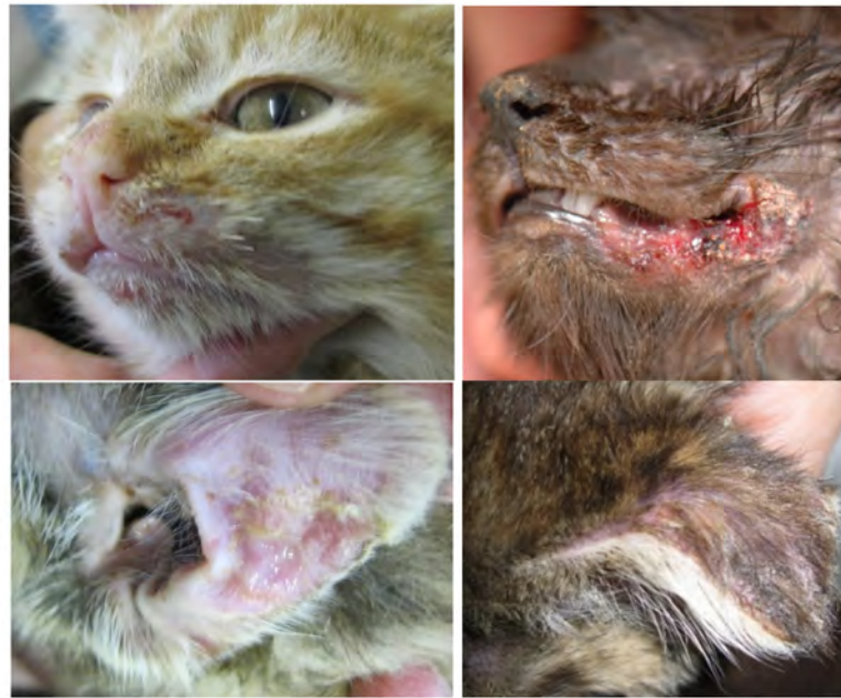
Figure 8. Crusted lesions and ulcers of cats with VS-FCV infection: facial, mucocutaneous (lower lip and commissure) and ears.

Not all cats with VS-FCV infection show all the typical clinical signs, which makes it difficult to recognize all affected cats.