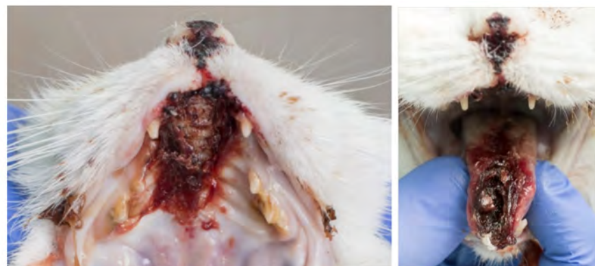
Figure 9. Severe necrosis (philtrum, palate, tongue, lip commissure) in a cat with VS-FCV infection.

Moreover, paw and mouth disease associated with FCV infection is characterised by similar initial clinical signs, including oedema, mouth and skin ulceration, and fever [100,102]. Some of the cats with VS-FCV disease are jaundiced (e.g., due to hepatic necrosis, pancreatitis) (Figure 11); some can show severe respiratory distress (e.g., due to pulmonary oedema). Thromboembolism and coagulopathy caused by disseminated intravascular coagulopathy can be observed, causing petechiae, ecchymoses, epistaxis or bloody faeces [3,64,107]. Typically, VS-FCV outbreaks start in multicat environments, such as animal shelters or veterinary clinics, and are usually characterised by the clinical signs listed above, epizootic spread and a high mortality.