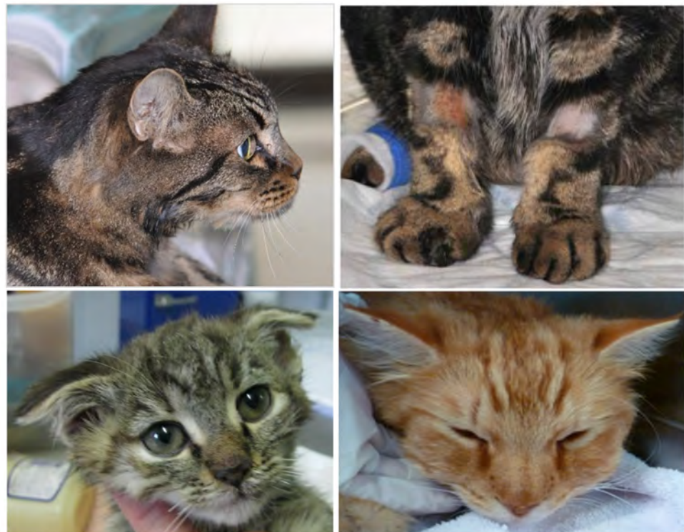
Figure 7. Oedema of the head and limbs in cats with VS-FCV infection.

The clinical signs of VS-FCV infection are variable. The initial findings are frequently typical of a severe acute upper respiratory tract disease. Characteristic signs are cutaneous oedema and ulcerative lesions on the skin and paws [3]. Oedema is located mainly on the head and limbs (Figure 7). Crusted lesions, ulcers, and alopecia can be seen on the nose, lips, ears, around the eyes (Figure 8) as well as in the mouth and on the tongue (Figure 9), and on the footpads (Figure 10).